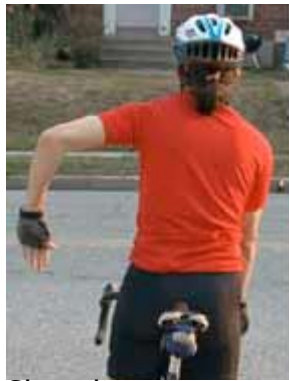
Slow down or stop